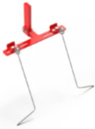
Torsion weeder on separate attachment (also suitable for hoeing share)