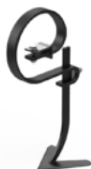
S tine with share