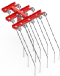
Weeder rake element, available in various widths