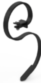
Spring tines; optional with duck foot share