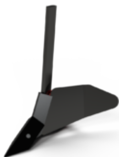
Ridger for leek with adjustable wings and Hardox top