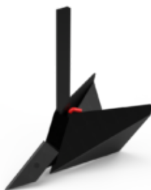
Ridger for ridges of carrots / potatoes with adjustable Hardox wings and Hardox top